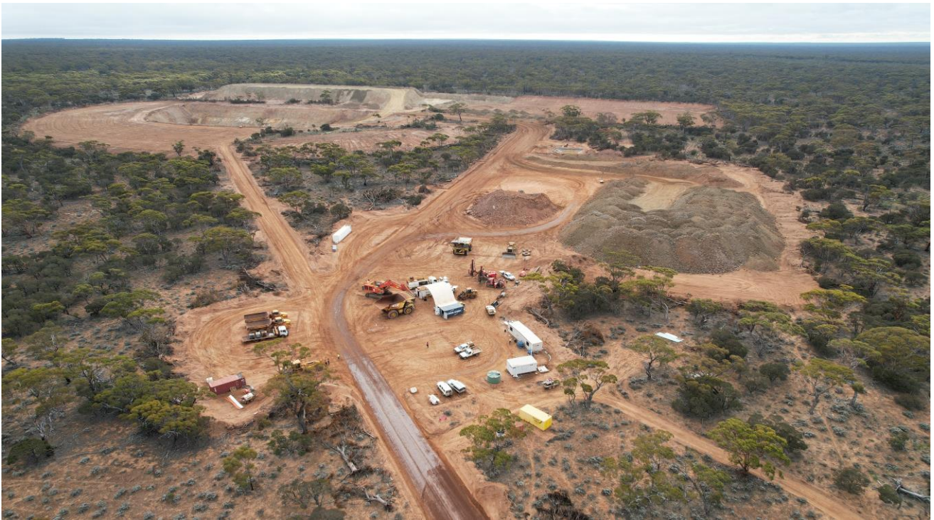
Figure 1. Jeffreys Find Mine Site at completion of the stage 1 pit – note Run of Mine ore stockpiles lower right.

In the first campaign, 36,180 dry tonnes were processed at a reconciled head grade of 1.58g/t for 1,721 ounces gold and a calculated recovery of 93.04%. The head grade in turn reconciled well with estimated mine grade for the ore parcel.