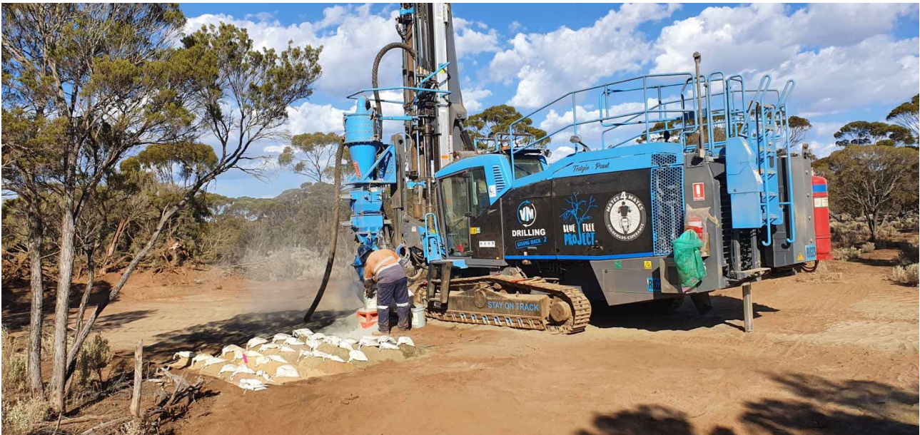
Figure 1. Grade Control drilling at Jeffreys Find.